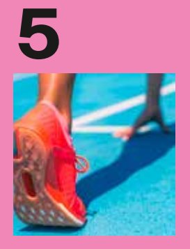
Anti-trust & competition

Responsibility to the environ ment and communities