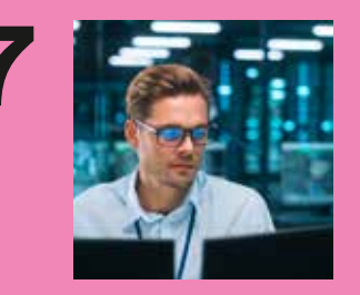
IT & data security and digital media